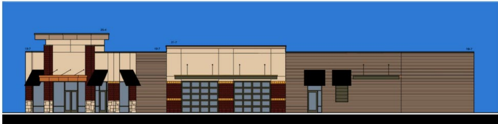
Building C – North View