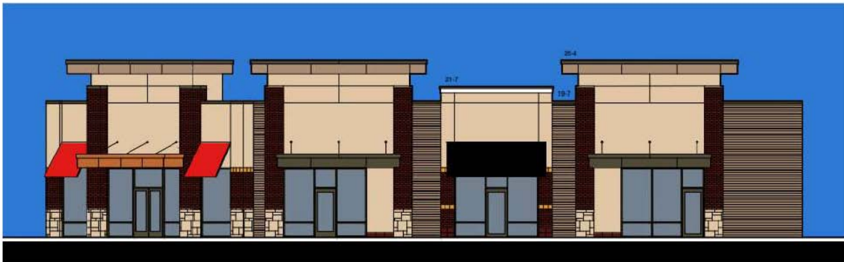
Building D – East View