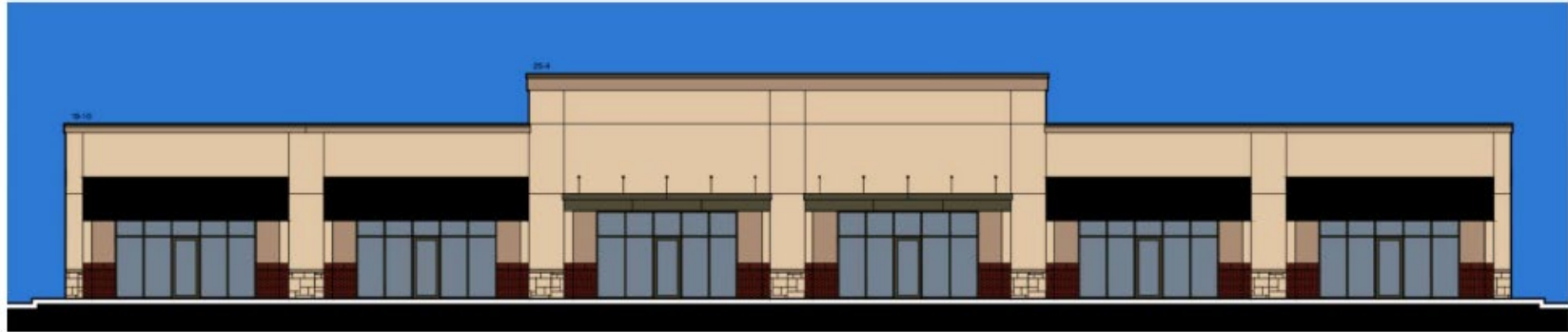
Building E – East View