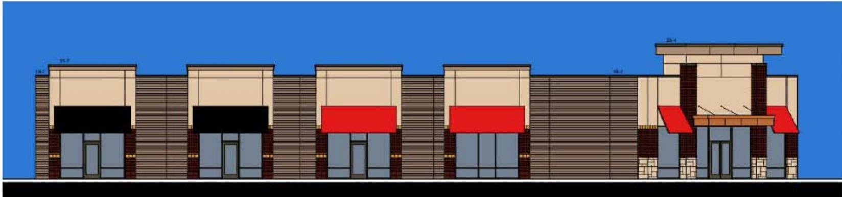
Building D – South View